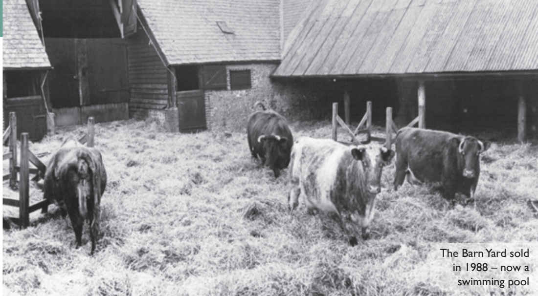
The Barn Yard sold in 1988 – now a swimming pool