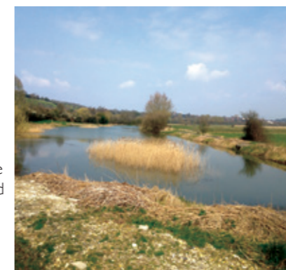
The Tench Lake

There are sections on our history, farming and environment. We have links to the websites of each of the businesses (featured in the panel on the right) and under 'Leisure' we have pages on the Iford Downs and Swanborough Shoots, the airstrip,