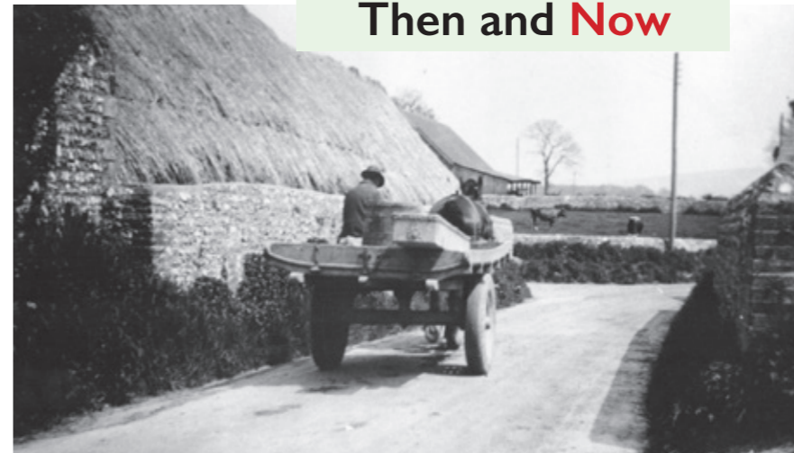
Mr Blaber c1930 The water tank on the cart is still in use on the estate today