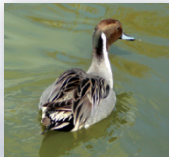
Above: Pintail drake. Below: Lapwing over the flooded Iford bird hide

Our mild, wet winter has been disastrous for people on the flood plains, particularly up north. Here the flooded fields, while an inconvenience to us, provide an attractive habitat for waders and waterfowl. On an early January walk down to the bird hide it was uplifting to see so many duck and geese – wigeon in their hundreds whistling away to each other, mallard and teal of course, as well as the beautiful shoveller duck and the less seen pintail, so called for its needle of a tail, as you can just see in the inset picture.