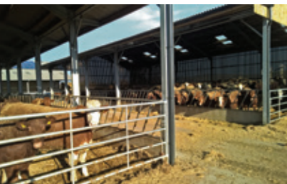
Cattle enjoying the sunshine in the new buildings put up this autumn